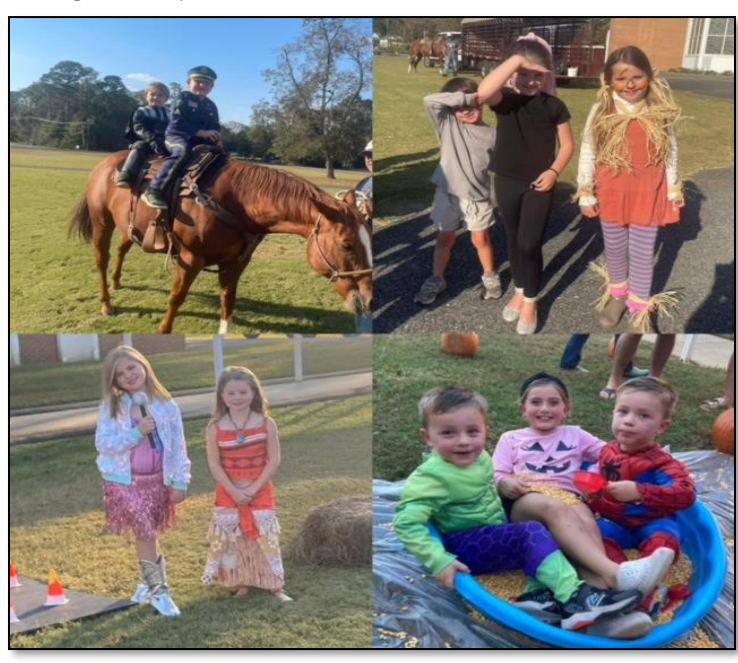
We had a GREAT time at the Halloween Nursing Home Parade on October 30<sup>th</sup>!

THANK YOU to all those who made the FALL FESTIVAL a success! It was a great day! The cakewalk raised $618 for Called to Care!